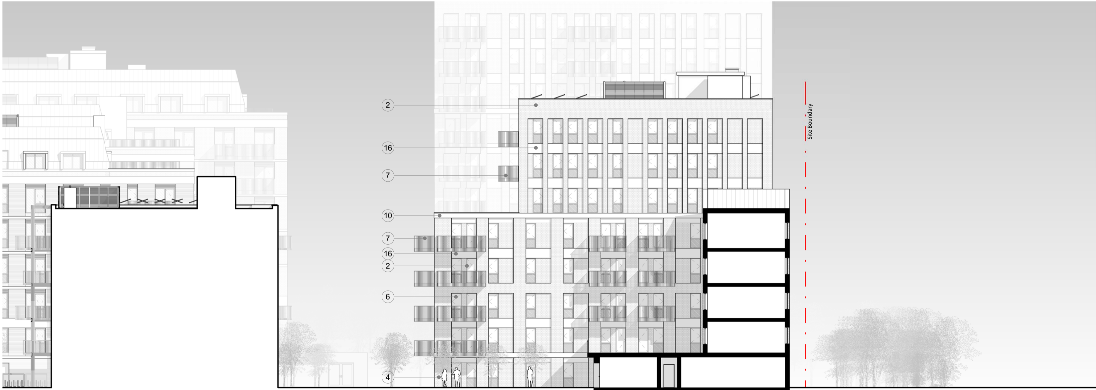
3 Building 8 - East Elevation 1 : 200