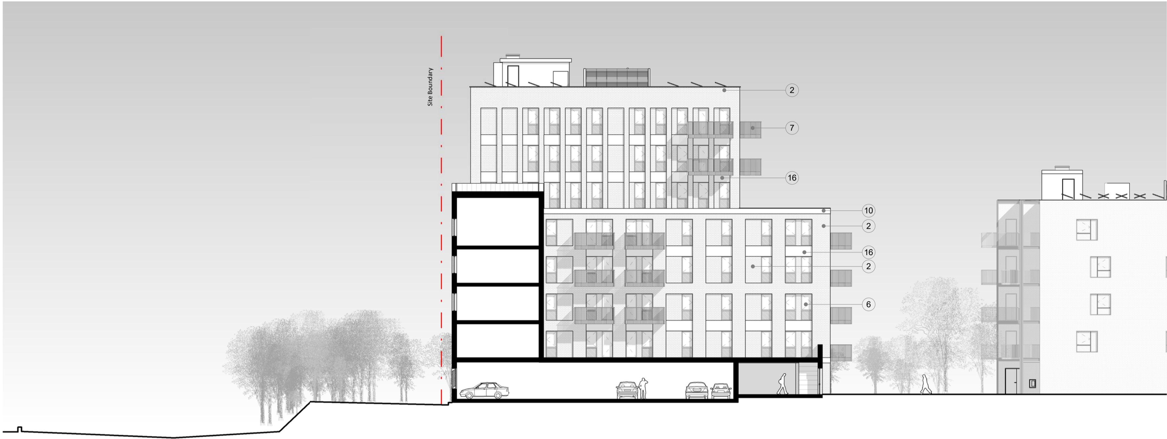
1 Building 8 - West Elevation 1 : 200