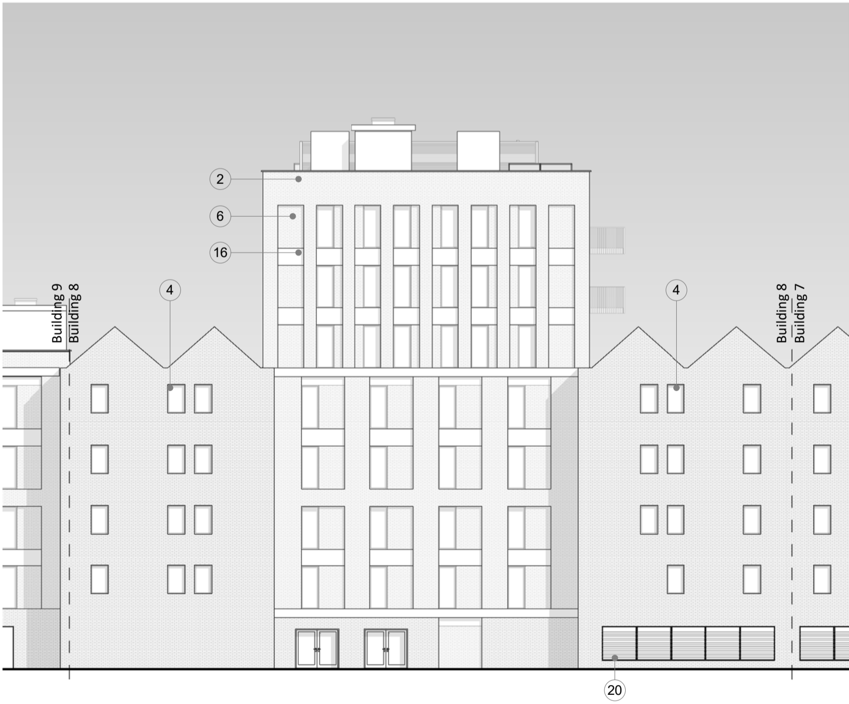
4 Building 8 - North Elevation 1 : 200

NOTES CONSULTANTS - Refer to highways consultant's drawings for details - Refer to landscape consultant's drawings for details - Landscaping layout is indicative only AREAS - Refer to area schedule © Copyright Reserved. ColladoCollins Architects Ltd