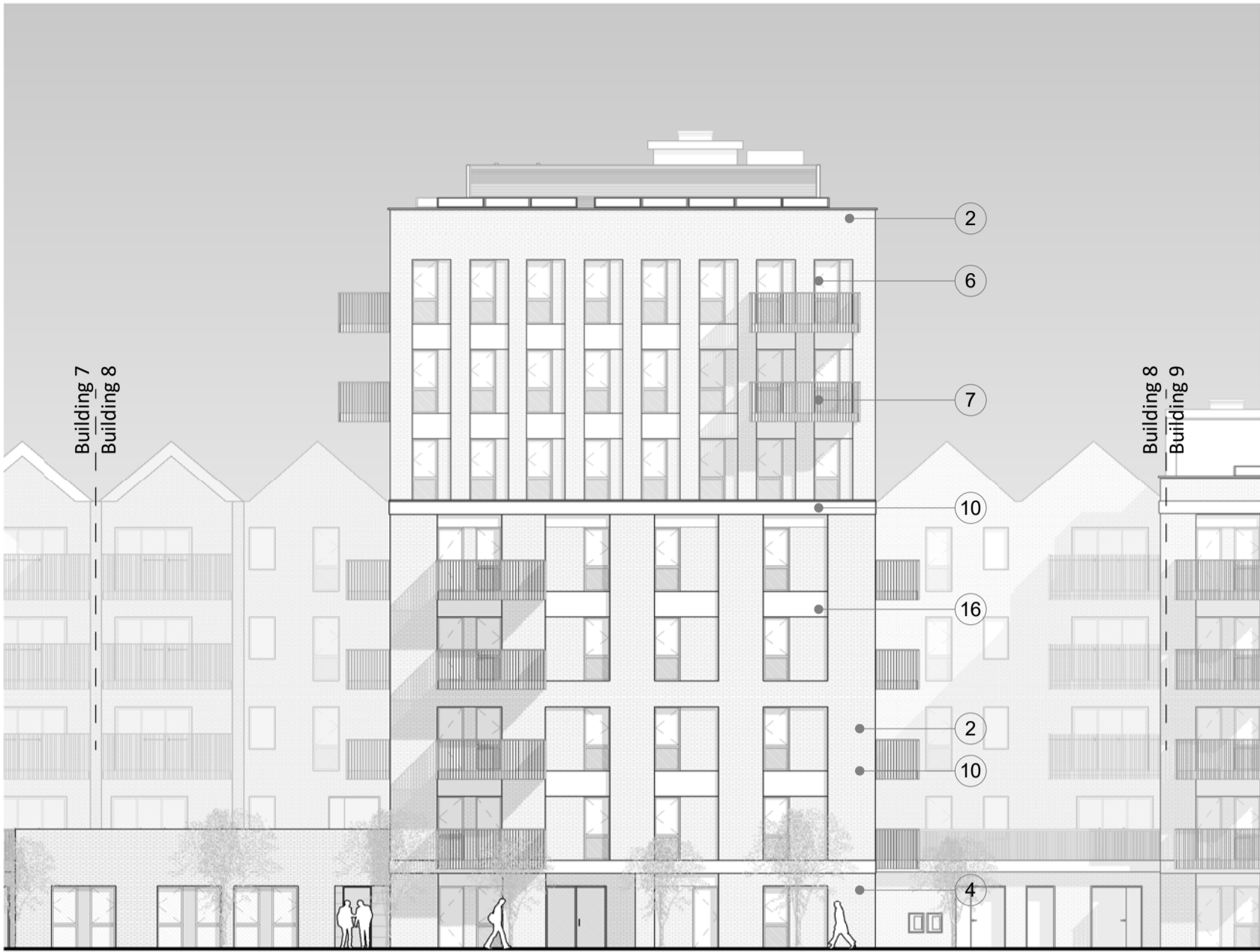
2 Building 8 - South Elevation 1 : 200